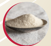
Xanthan Gum hydrating and viscosifying