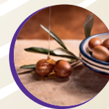
Argan Oil Protective and antioxidant