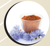
Inulin (Chicory extract) Hydrating