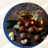
Macadamia Oil Soothing and conditioning