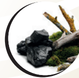
Vegetal Charcoal Purifying and withening effects