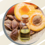
Apricot Oil Protective and emollient