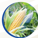
Corn Proteins Conditioning and emulsifying