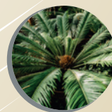
Babassu Oil Protective and hydrating