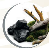
Vegetal Charcoal Purifying and whitening effects