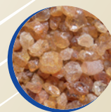
Guar Gum Soothing and softening