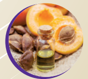
Apricot Oil Protective and emollient