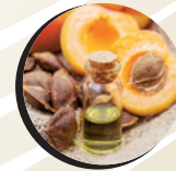
Apricot Oil Protective and emollient