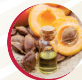
Apricot Oil Protective and emollient